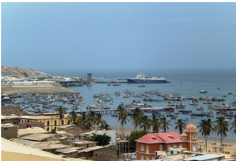
Photo: Town of Tumbes, Northern Peru. The “M/V Geowave Endeavour” enroute to Karoon’s jointly held Block Z-38. Karoon has completed agreements to gain up to 75% equity interest in Block Z-38. Currently Karoon holds a 60% equity interest.

For further information please see the Karoon website www.karoongas.com.au or contact: